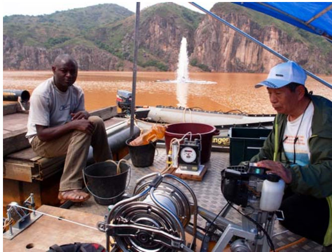
Fig. 4 YY-method at Lake Nyos