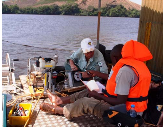
Fig. 2 YY-method at Lake Monoun