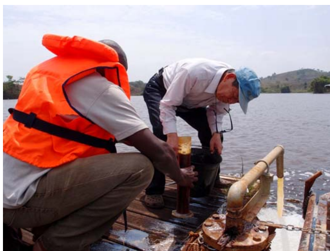
Fig. 1. Measurement of flow rate of deep water at the pipe mouth.

The solar power driven deep water removal system installed in December 2013 is working well. We added chain and turn buckles to reinforce the connection of the two rafts. We measured the flow rate of water at the output of drainage pipe. It ranged from 2.21 to 2.58 m 3 /h, with a mean value of 2.36 m 3 /h or about 25 m 3 /daytime. The flow rate fluctuated slightly depending on the solar intensity. Water flow through the annulus between pipe and pump was estimated to be greater than that of the pump. This was caused by gas self-lift that was strengthened by our solar power driven deep water removal system. Currently the daily removal rate of deep water is estimated to be >100 m 3 .